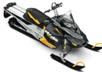
Sled may be different than one pictured

Any and all prize taxes are the responsibility of the winner